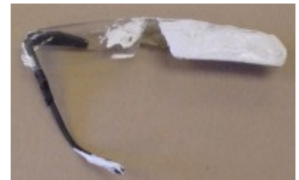
10/30/2003 Epoxy flush dis- charged in the air hitting the employee in the face. The material melted the safety glasses.