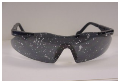
7/19/2008 Material sprayed in the face of the person wearing these safety glasses