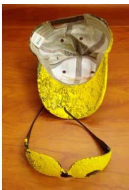
7/14/2012 Spray Thermo- plastic material sprayed in the face of the person working on the STP gun